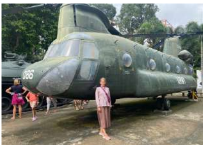
War Remnants Museum

*Flight: VN 109 DAD – SGN 09:15-10:50 (Ticket price excluded)