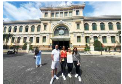
Centre Post Office