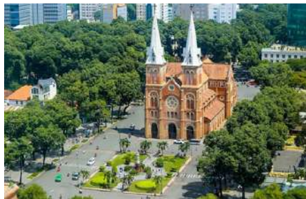
Cathedral of Notre Dame