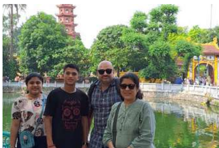
Tran Quoc Buddhist Pagoda