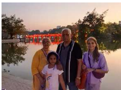
Ngoc Son Temple

Distance Noi Bai Airport – Hanoi Central: 35km -> 45 minute transfer