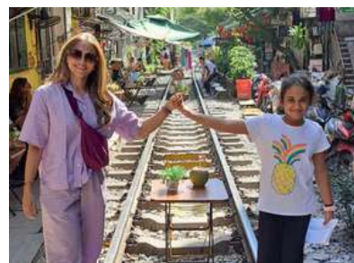
Hanoi's Old Quarter